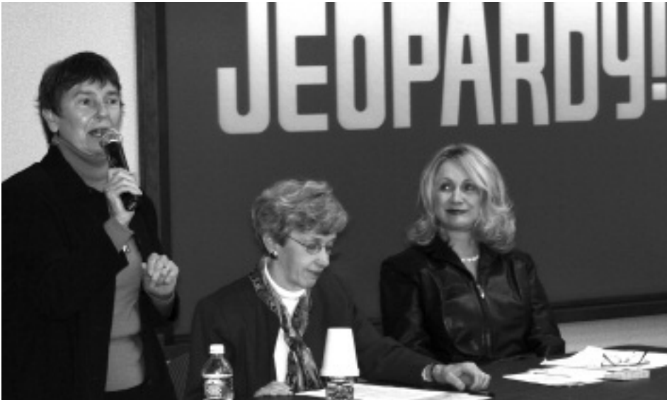
LFI '07 class members look ahead to the trends impacting our community through a changing demographic.