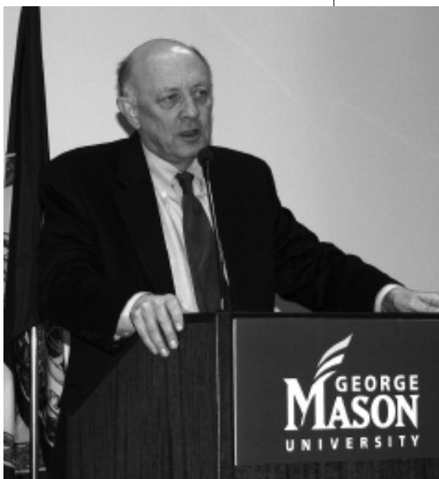
Former CIA Director Jim Woolsey speaks to ELI 2007 class.

This year's ELI program will focus on strategic planning, networking and business etiquette, negotiation and working effectively with others, presentation skills and community stewardship. In addition to leadership skills training, the class is working on the following communi-