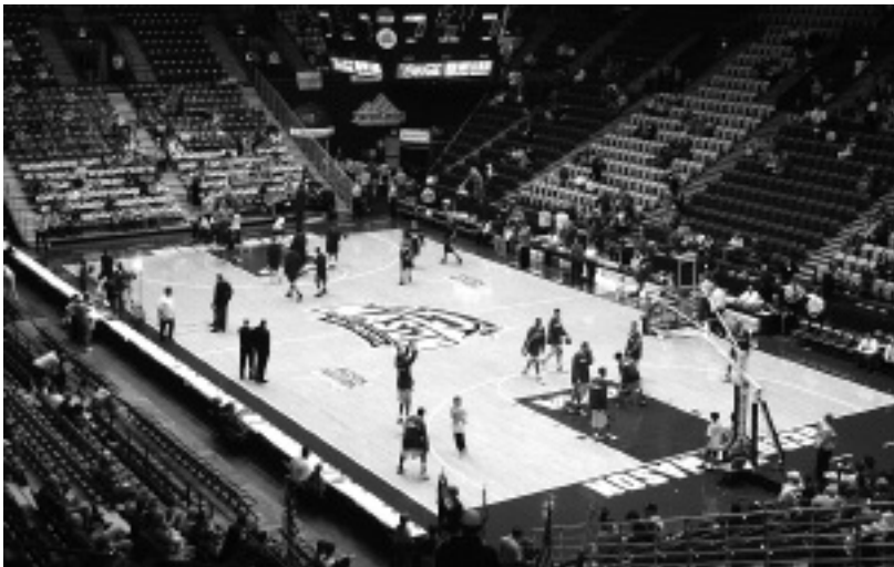
The Patriots burned up the court and won the game against James Madison University.