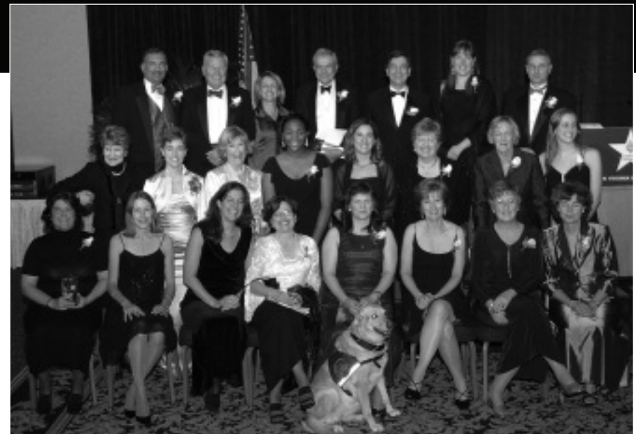
2005 Northern Virginia Leadership award recipients and finalists.

Since its inception, the Northern Virginia Leadership Awards program has honored a number of individuals, companies and organizations whose substantial contributions to the community have enhanced the quality of life and well-being of citizens throughout the Northern Virginia region. In 2005, over 400 people attended the NVLA gala to celebrate examples of outstanding leadership in our community.